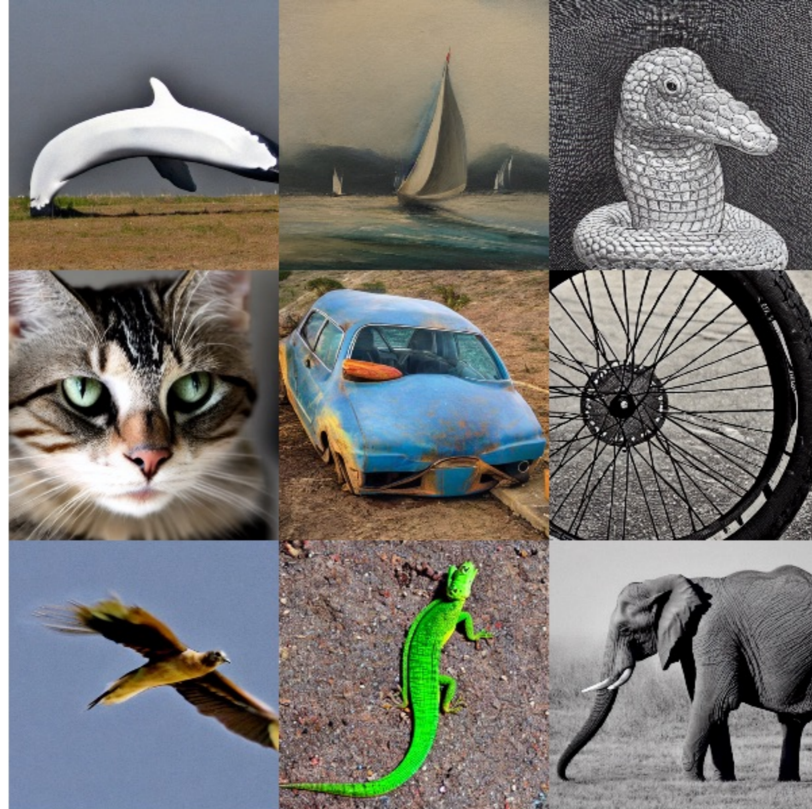
(a) SD 1.5